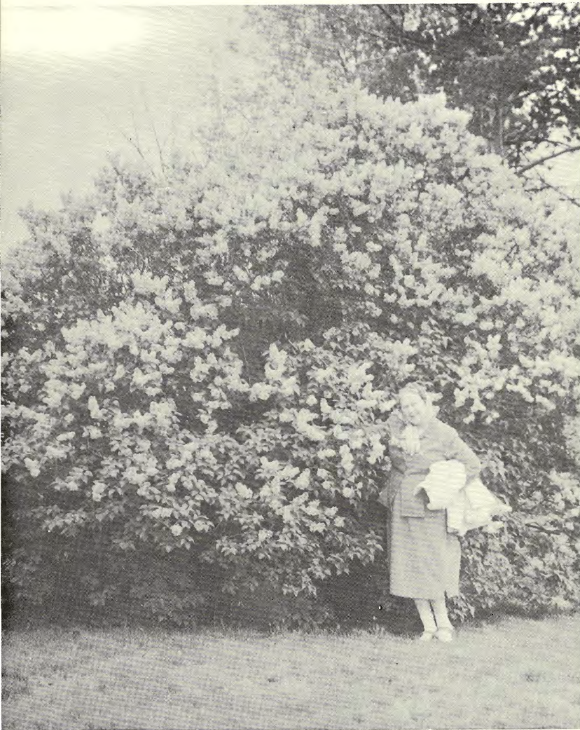
Lourene Wishart and some of the grand old 'Lemoine' lilacs at Lilac Farm