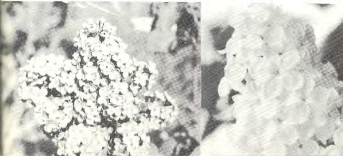
Lower right: Lilac "Carley"