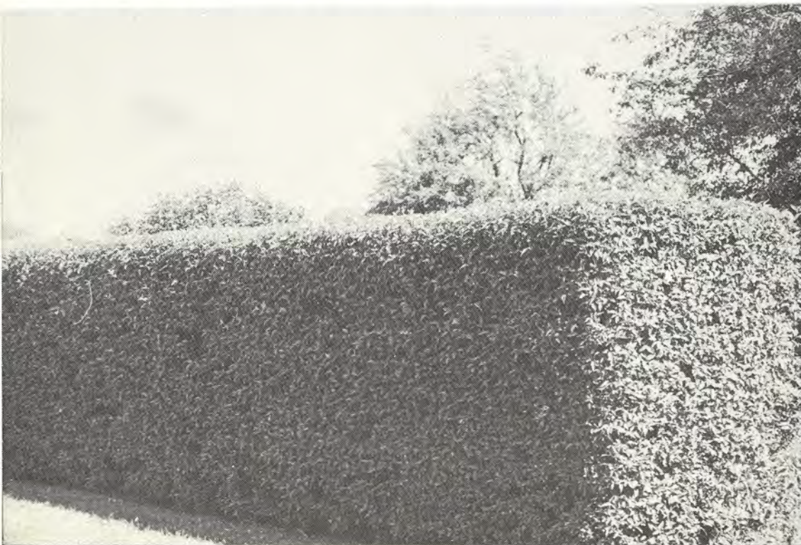
Clipped hedge of Syringa x chinensis (Rouen Lilac) planted on May 7, 1962 as 30" tall specimen. Now it is six feet tall, 3 feet wide, dense and disease free. Photo taken in June, 1973.