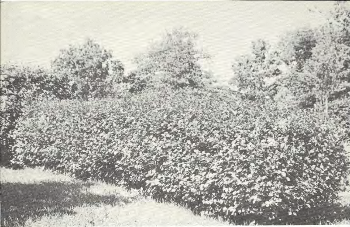
Syringa microphylla hedge. Planted on May 18, 1966, at the entrance to the lilac collection. It is being clipped twice a year. Blooms extensively first week in June. (see photo of single specimen). Photo taken in June, 1973.