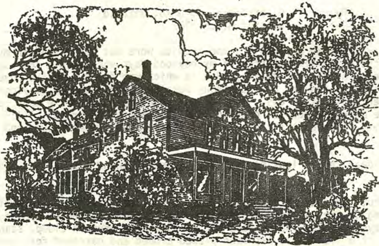
THE PLUM HOME ... 1869 ... LOMBARD