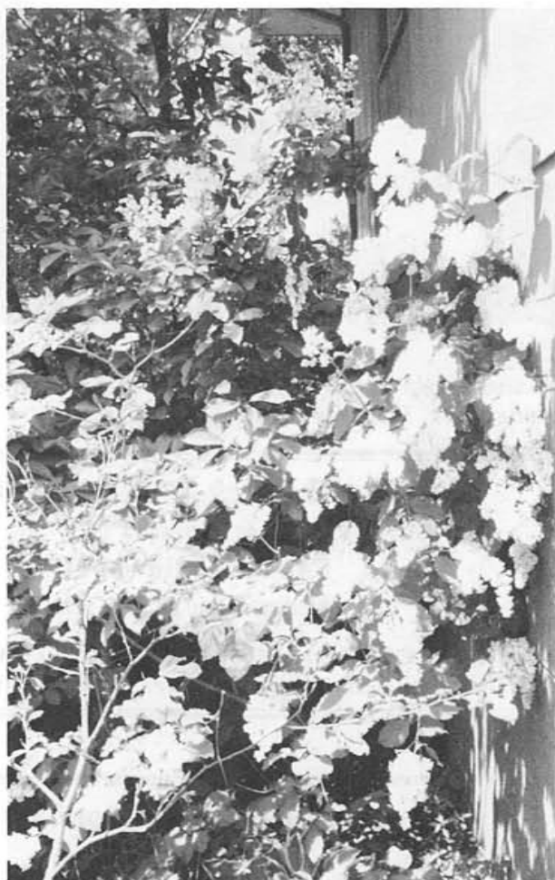
S. Prestoniae 'Agnes Smith'

On new growth of 12" to 24" a shower of blossoms developed. Fantastic! In all my years with lilacs I have never seen such bloom on new wood. The photo is underexposed, but you can see the results.