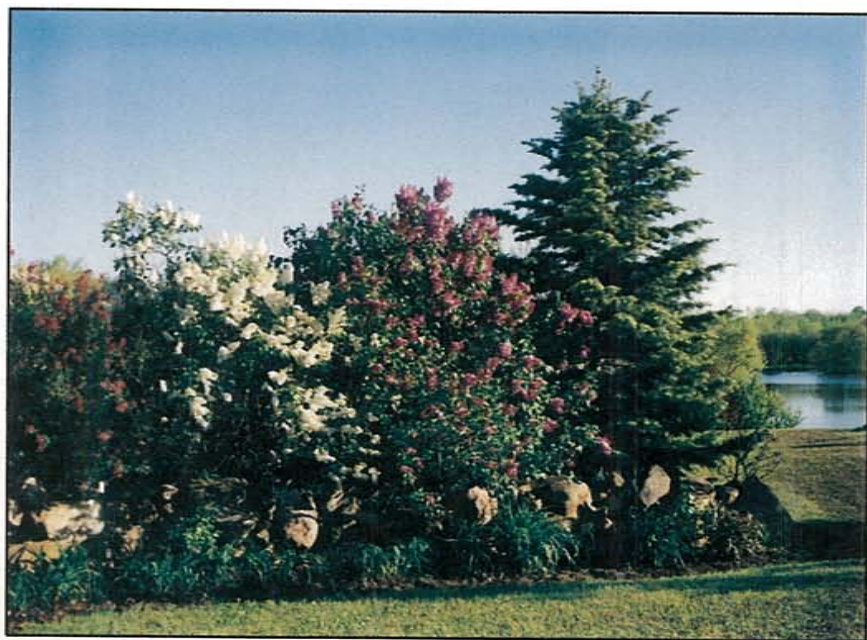
.Lilacs and Colorado Blue Fir at Falconskeape