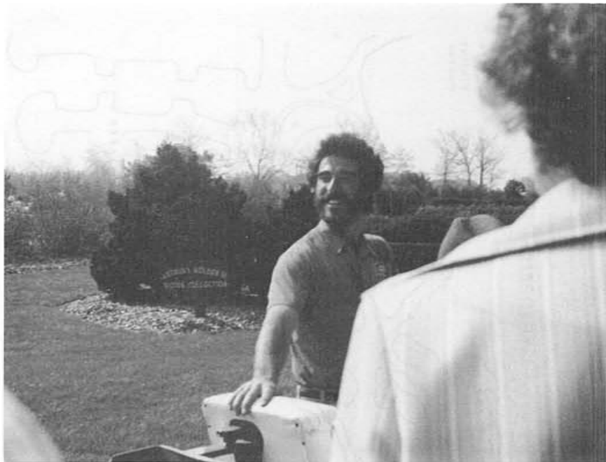
The Holden Arboretum Lilac Garden