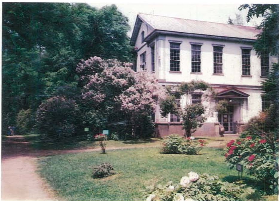
Hokkaido University Botanic Garden