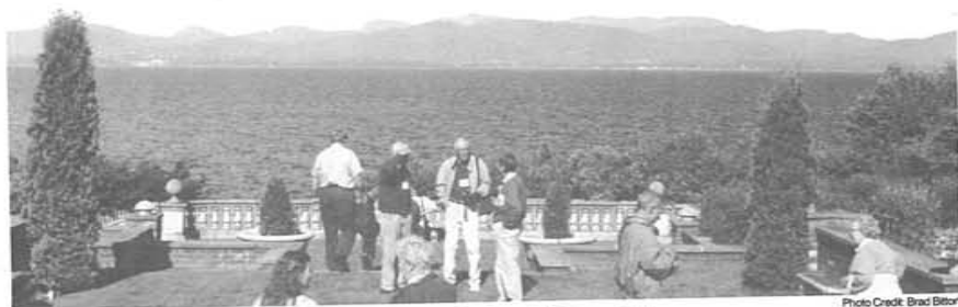
View over Lake Champlain