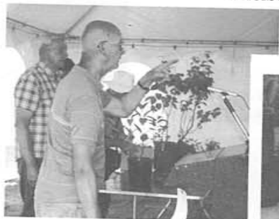
At The Auction