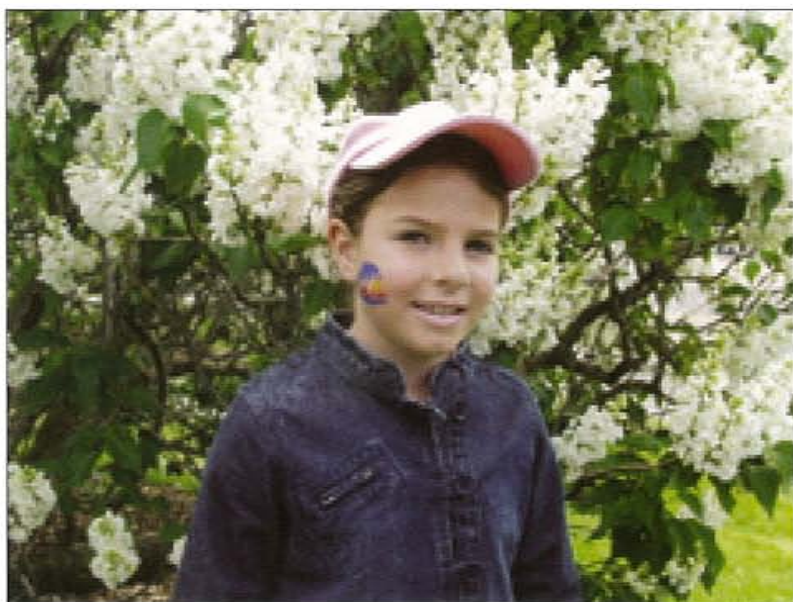
Face painting and a 'Rochester' lilac- what more could you ask for?