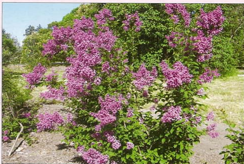
Syringa pubescens subsp. julianae 'George Eastman'