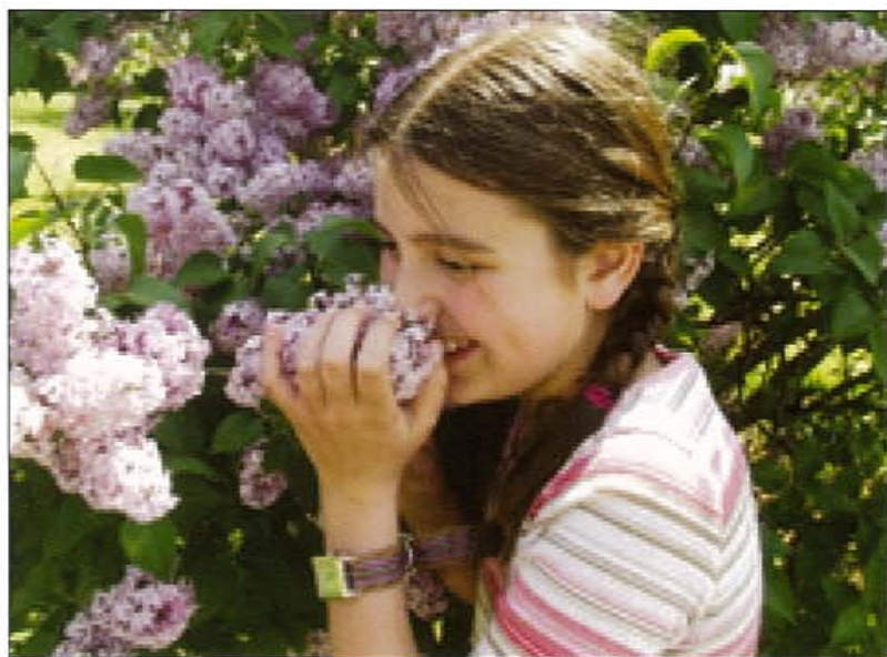
The fragrance of lilacs never fails to bring a smile!