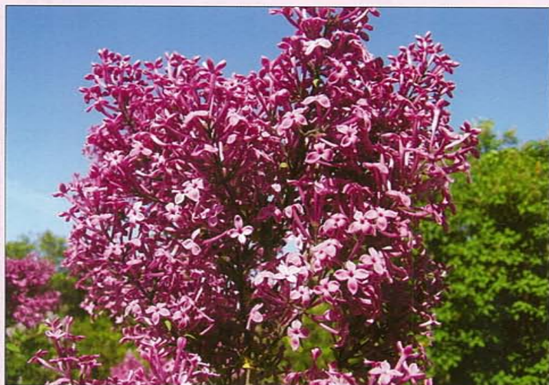
closeup of 'George Eastman' against a beautiful sky