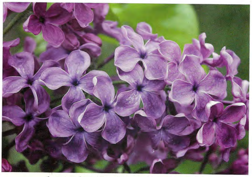
Syriinga vulgaris 'Sumerki'. note the cupped petals' This is one of Kolesnikov's early hybrids that he liked to use as a parent