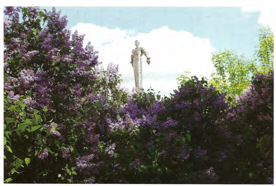
Lilacs surround the statue of Yuri Gagarin; first man in space