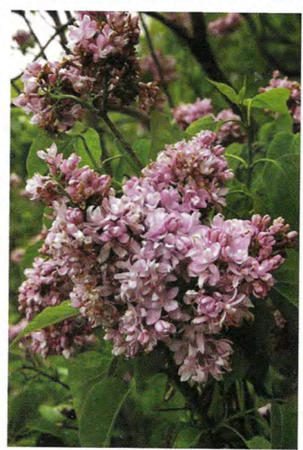
Syringa vulgaris 'I. V. Mi<u>ch</u>urin', a Kolesnikov hybrid that he used as one of the parents to produce 'Krasavitsa Moskvy'