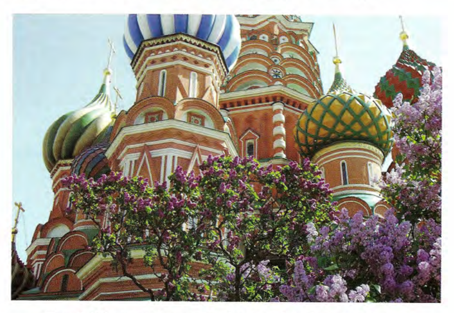
Beautiful lilacs near the very colorful St. Basils Cathedral in Moscow