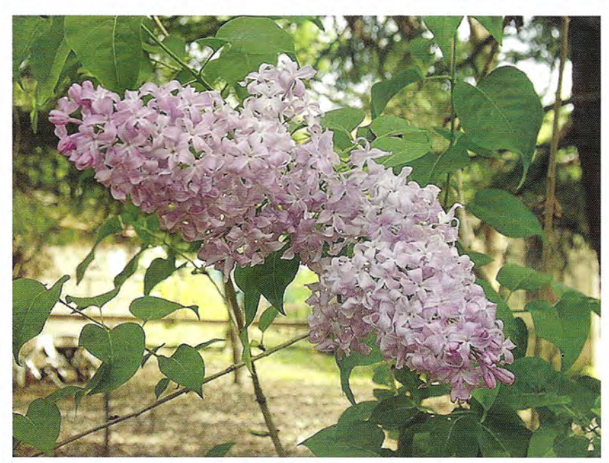
Syringa vulgaris 'Forrest Kresser Smith'; parent of 'Daisy Wolcott'