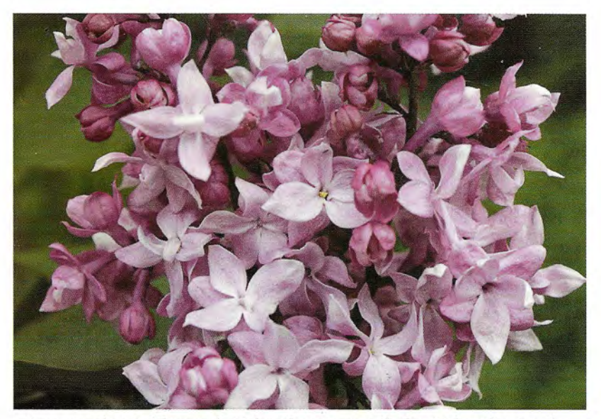
Syringa vulgaris 'Olimpiada Kolesnikova'; named after Kolesnikov's wife