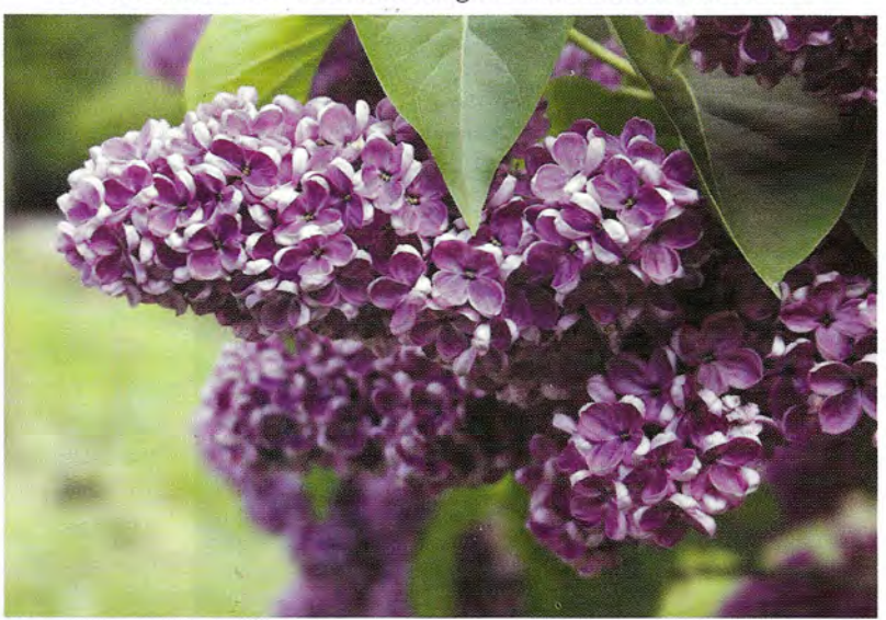
Syringa vulgaris 'Leonid Leonov'