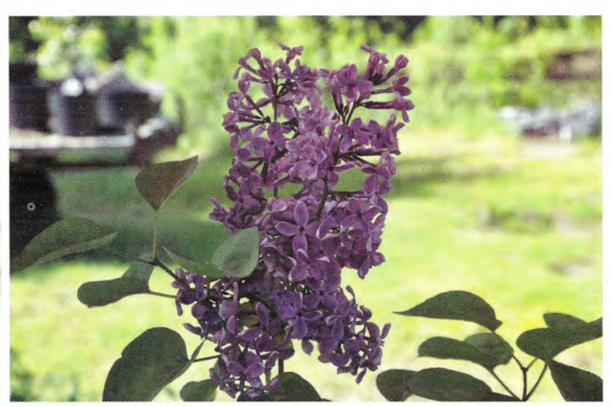
New Frank Moro cultivar Syringa vulgaris 'Lover's Spell'