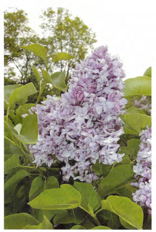
Syringa vulgaris 'Nebo Moskvy'