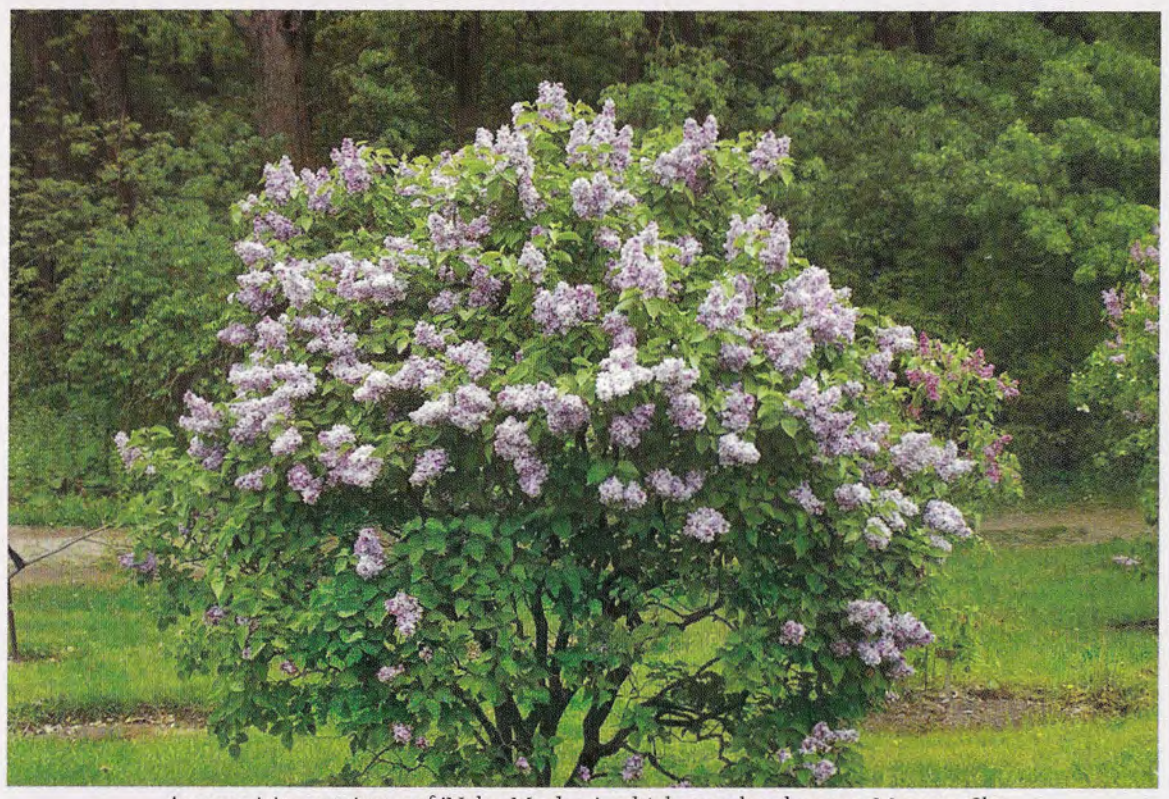
An exquisite specimen of 'Nebo Moskvy' which translated means Moscow Sky