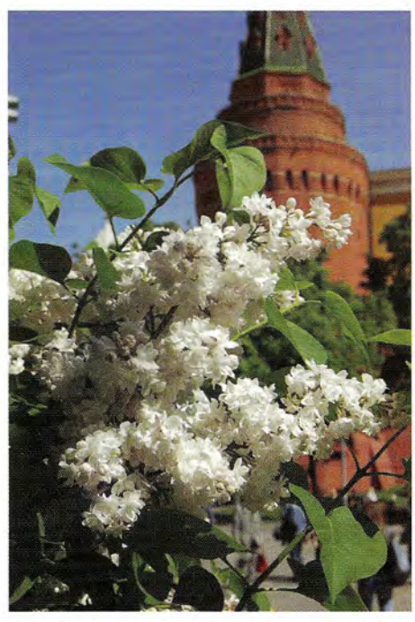
'Krasavi<u>ts</u>a Moskvy' near the Sobakina Tower of the Kremlin