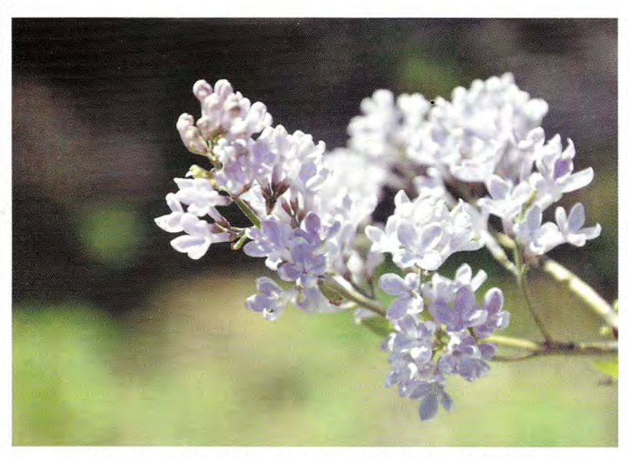
New Frank Moro cultivar Syringa vulgaris 'Daisy Wolcott'