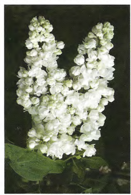
Syringa vulgaris 'Pam<u>ya</u>t o Kolesnikove'