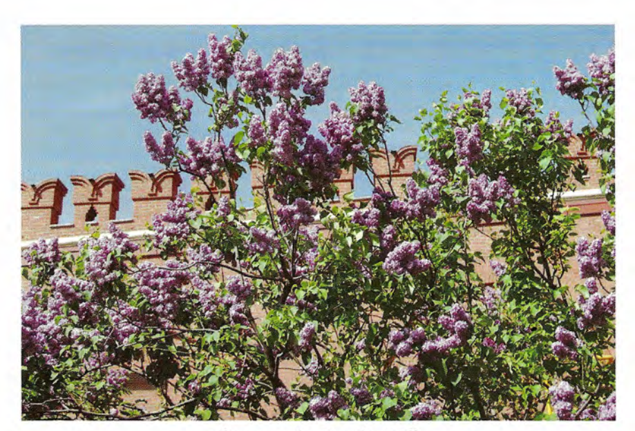
Lilacs near the Kremlin Wall