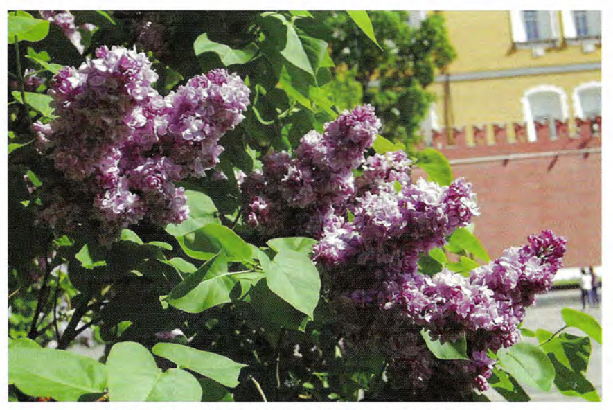
A cultivar of Leonid Kolesnikov near the Kremlin