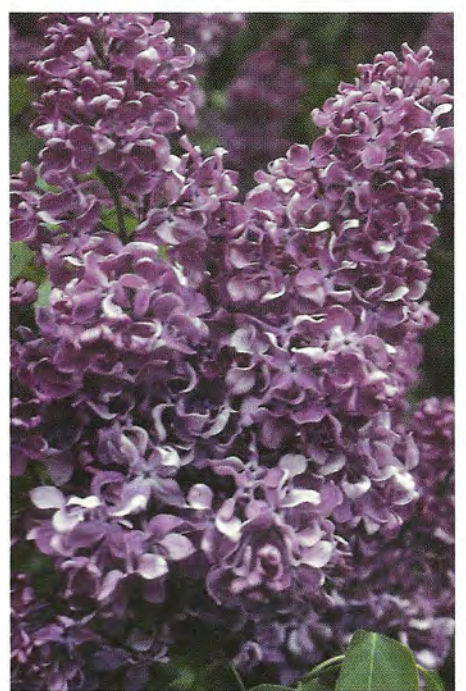
Syringa vulgaris 'Aleksei Mares'ev'