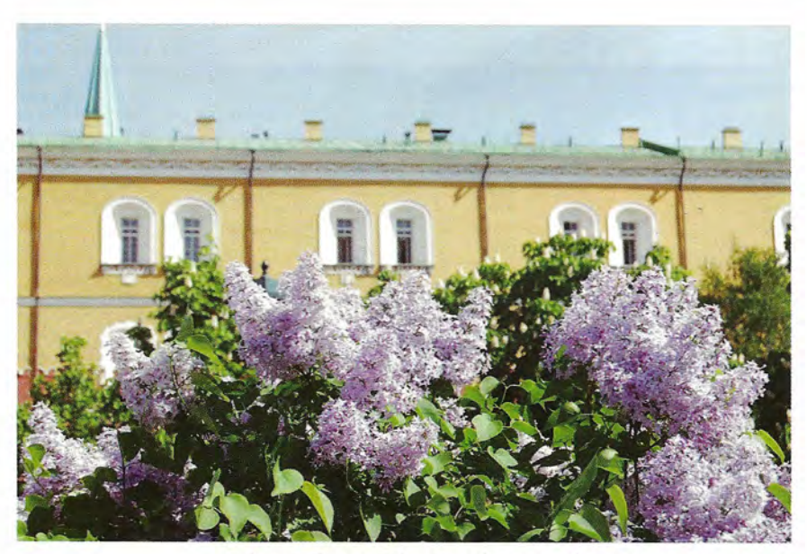
Lilacs in front of the Kremlin arsenal