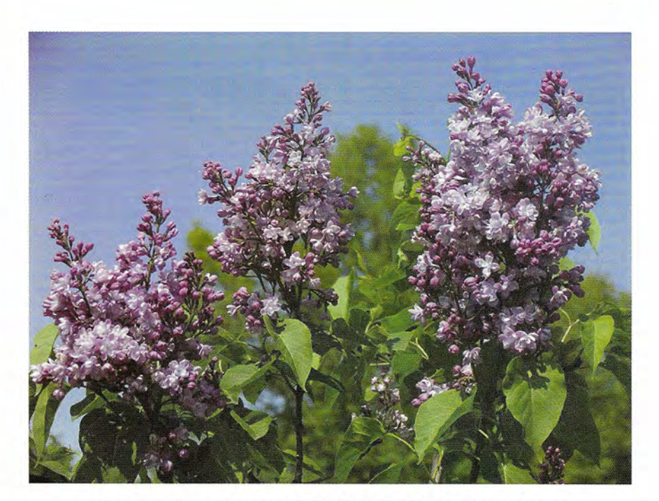
Syringa vulgaris 'Pam<u>ya</u>t o S. M. Kirove' with very large thyrses Photo Credit Charles Holetich from Lilacs DVD DDDVD