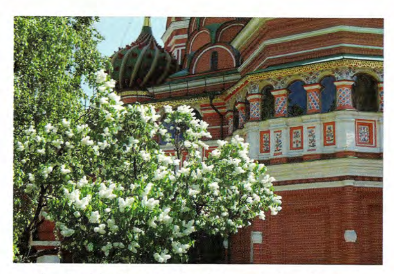
The white lilacs don't "clash" with the vivid colors of St. Basils